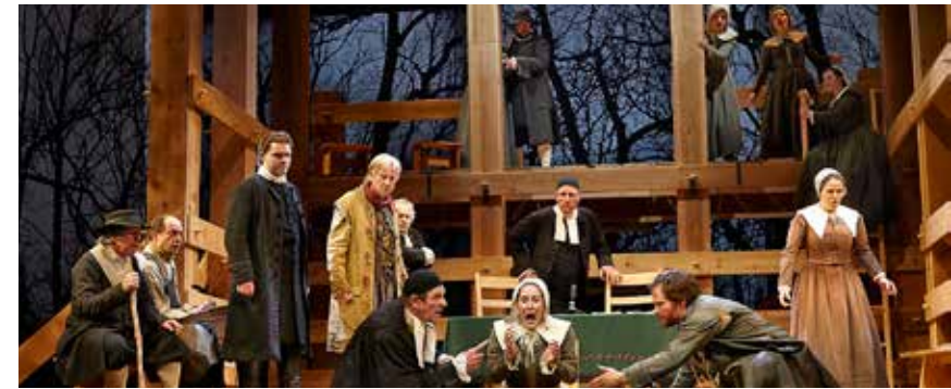
The cast of The Crucible . Photo by Trudie Lee