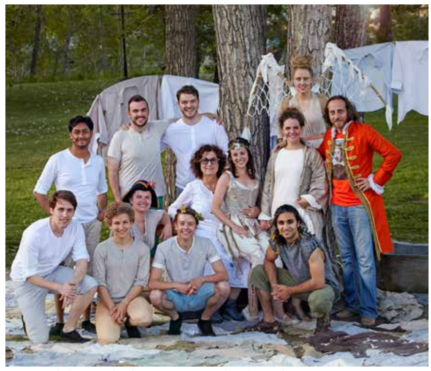
Our 2015 Shakespeare by the Bow company.

Our 2015 SBTB production of The Tempest , played to record crowds and record support. Our final attendance peaked at 11,008 patrons, which marks the largest overall crowd since Theatre Calgary first became involved with this emerging artist program in 2012.