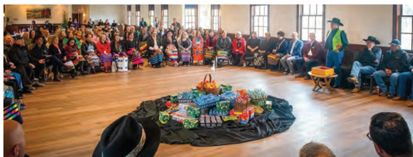
Blackfoot Naming Ceremony at The Confluence Historic Site & Parkland.